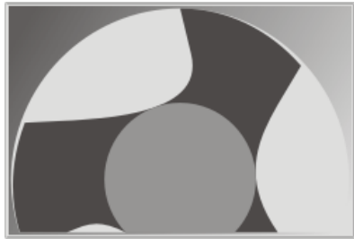
Counter flute with special grinding procedure